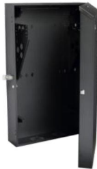
Greater Equipment Mounting Depth and Load Rating