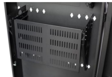
0U Mounting Options