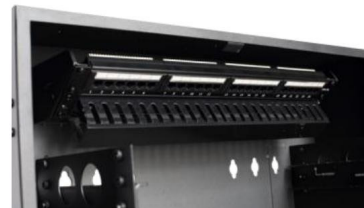
High Density Cable Management