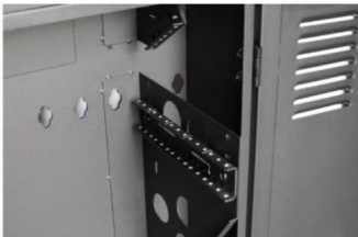
Vertical Rail Mounting