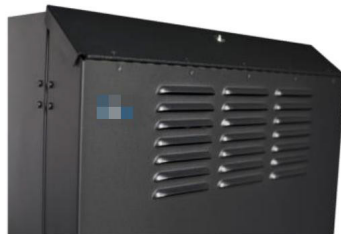
Max Airflow for High-Power Equipment