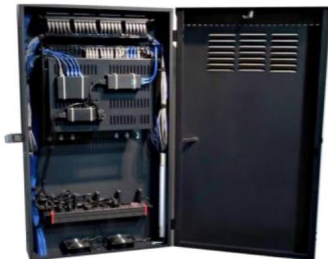
Full Access to Equipment